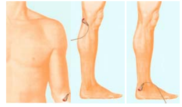
Areas of elbow and popliteal fossae and 3. external malleolus and Achilles tendon